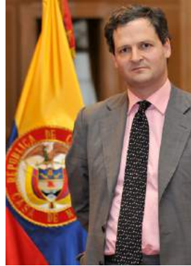
Sergio Jaramillo Caro

Ambassador of Germany to Bosnia and Herzegovina