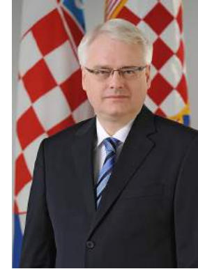
Prof. Dr. Ivo Josipović